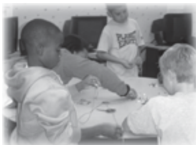
Youth from the REACH program work together on a project

REACH, or Recreation & Education Are Creating Hope, blends the recreational opportunities of the Pannell Center with our successful after-school literacy education instruction. This dynamic new program reaches 50 elementary school students a day with a unique blend of activities that promote physical and academic growth.